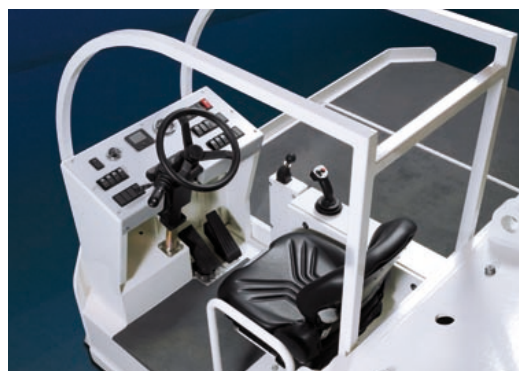
optional open driver's stand at rear