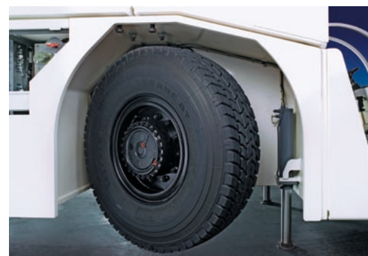
optional integrated hydraulic jacks